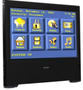
Communication Device e.g. for the elderly

Smart Home Control Surveillance, Home Automation