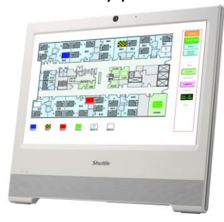
Device Control e.g. for health services or fitness equipment

Call System e.g. for nurses (hospital) or security personnel