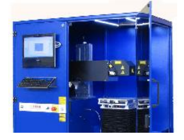
Visualisation e.g. for industrial production machines

Entertainment e.g. at the dentist or in the waiting room